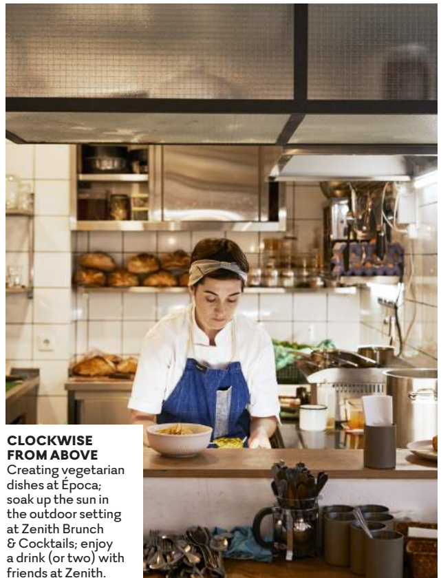
CLOCKWISE FROM ABOVE Creating vegetarian dishes at Época; soak up the sun in the outdoor setting at Zenith Brunch & Cocktails; enjoy a drink (or two) with friends at Zenith.